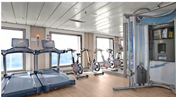
Gym, deck 7