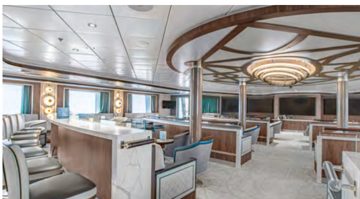
Shackleton Lecture Room, deck 5