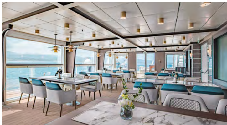
Panorama Restaurant, deck 8