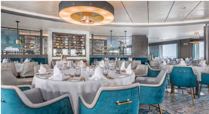
Beagle Restaurant, deck 5