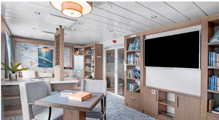
Library, deck 5