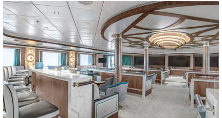
Shackleton Lecture Room, deck 5