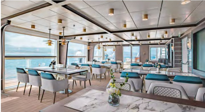
Panorama Restaurant, deck 8