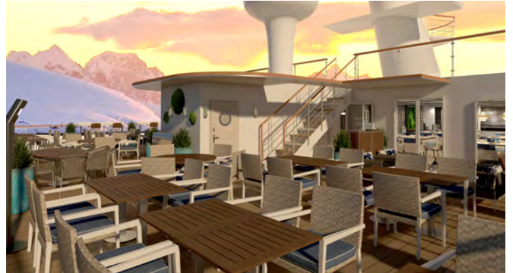
BBQ Deck, deck 8