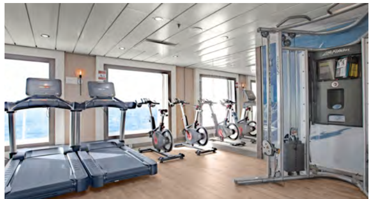
Gym, deck 7