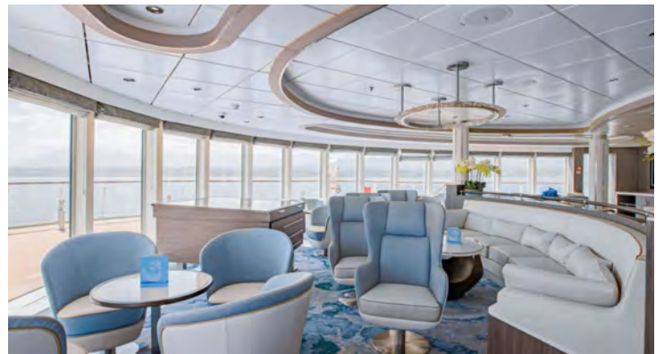
Observation Lounge, deck 8