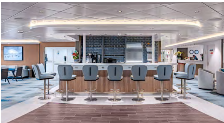
Nordic Bar and Lounge, deck 5